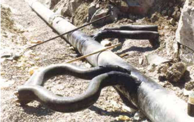
Original style factory insulated goosenecks- these are now produced on one end of a full length of insulated copper pipe

In the communities of Whitehorse and Watson Lake, Yukon, the original style of factory insulated goosenecks services included a thaw wire which could be energized by an adjustable current generator. These service connections have evolved into one full length of insulated copper pipe.