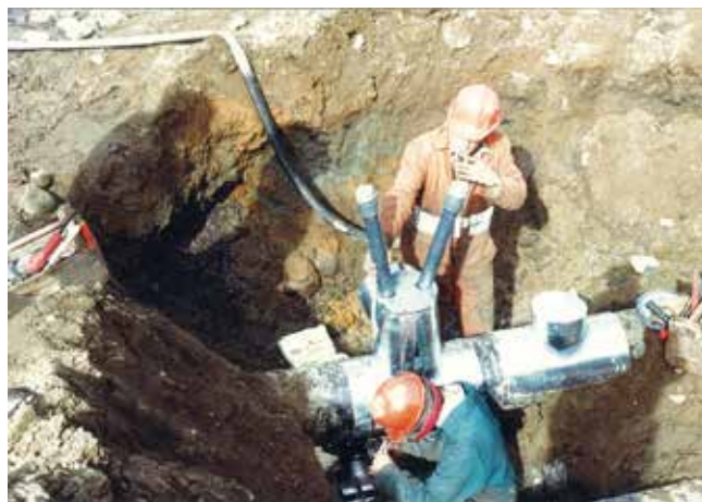
NWT service kit for residential water service connection.

and ordering. Over the years these service kits have evolved into three distinct versions depending on the northern region where they would be installed.